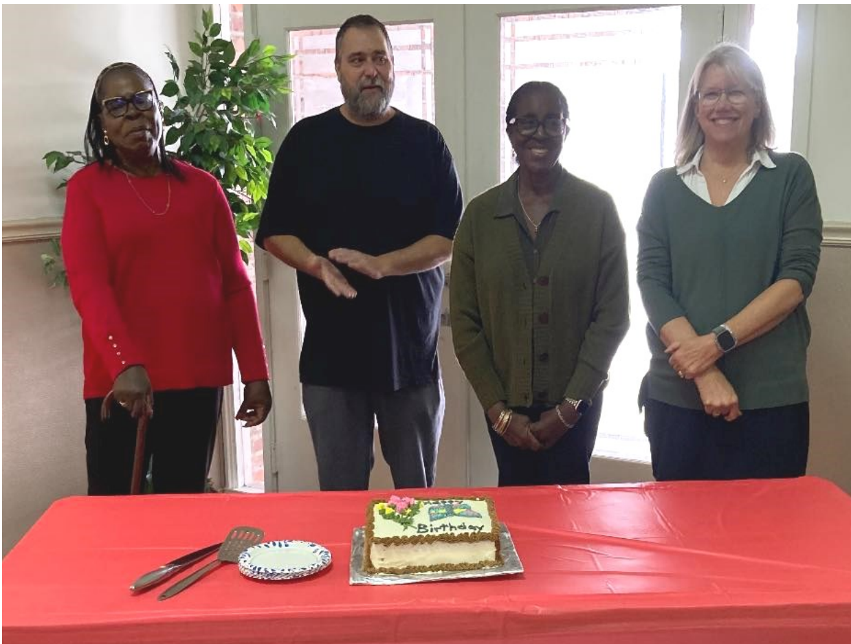
November 2025 Birthdays