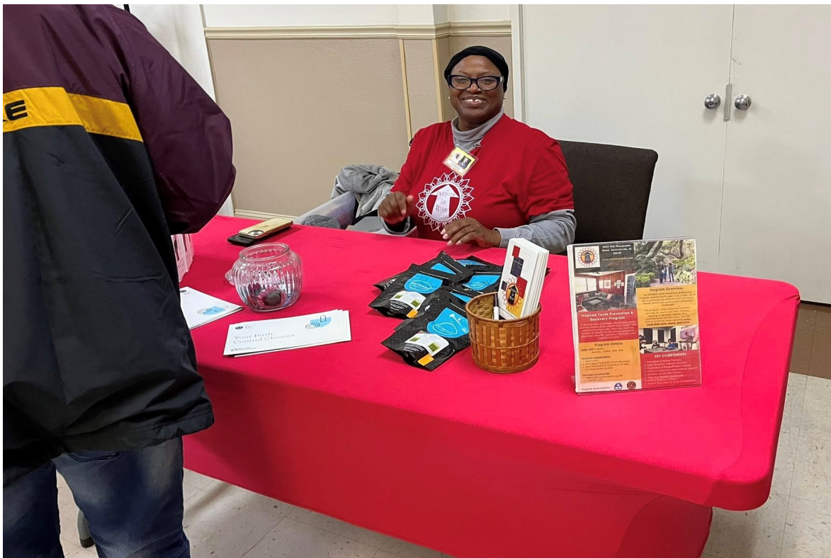
Inspire to Rise For more information, visit www.weinspiretorise.org