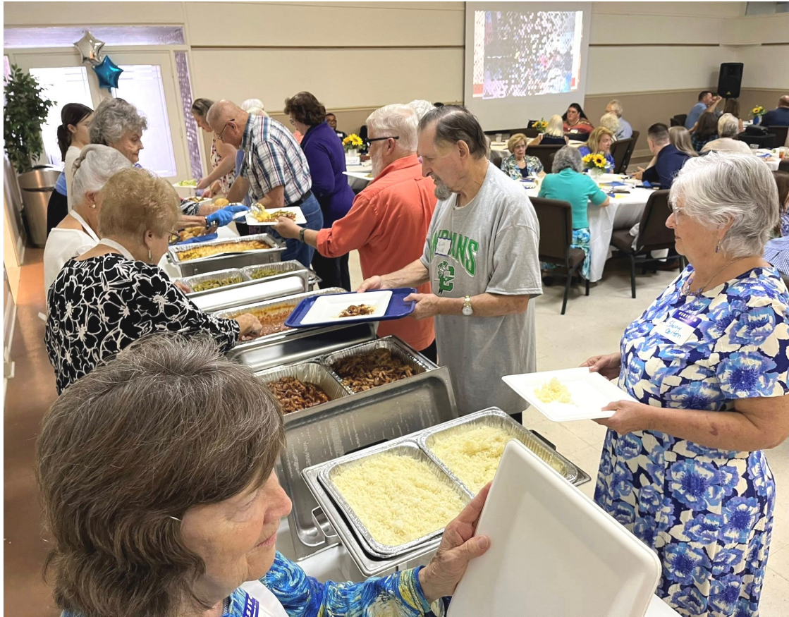
Dinner Time! Buffet sponsored by Golden Corral