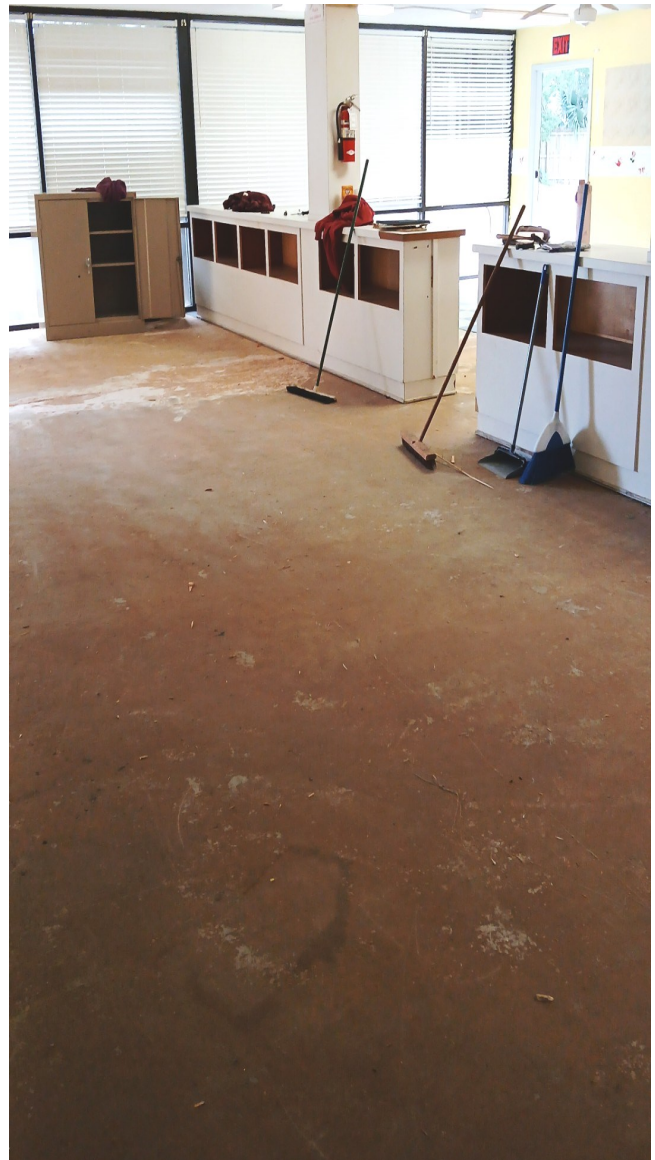
Former Nursery and Positive Family Pivot