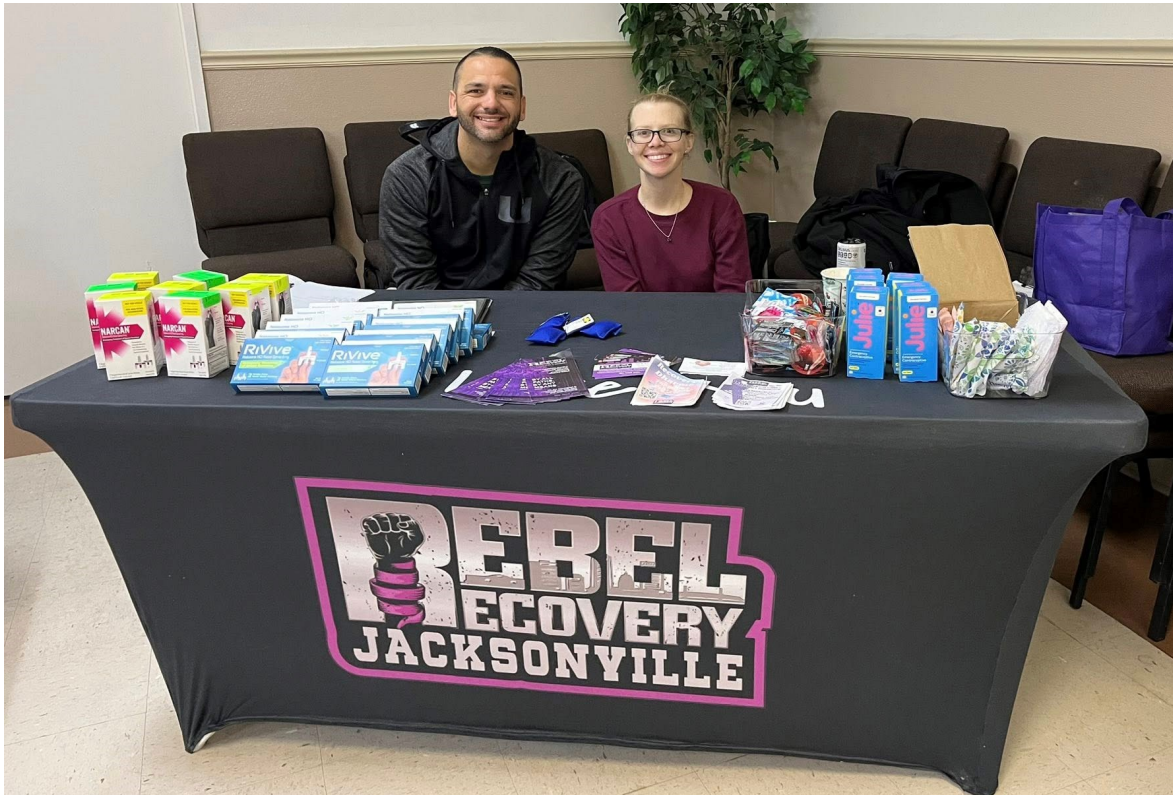
Rebel Recovery Jacksonville For more information, visit https://jax.rebelrco.org